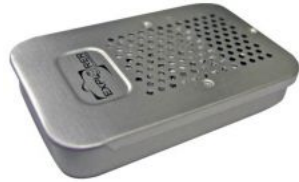
KIN.0481 - SILICA BOX